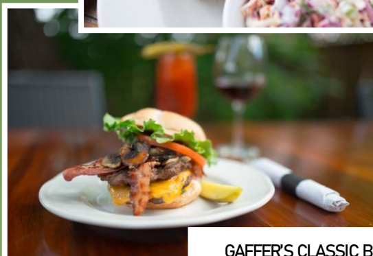
GAFFER'S CLASSIC BURGER

ASK YOUR SERVER FOR TODAY'S CHEF'S SPECIAL