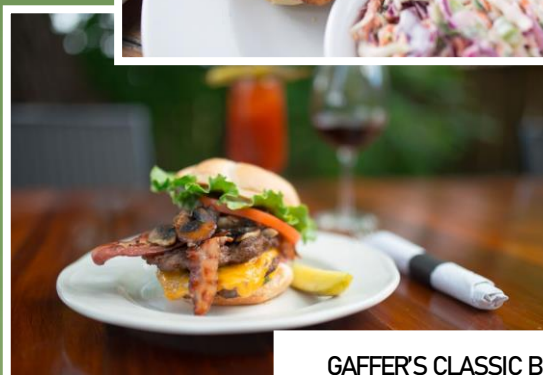
GAFFER'S CLASSIC BURGER

ASK YOUR SERVER FOR TODAY'S CHEF SPECIAL